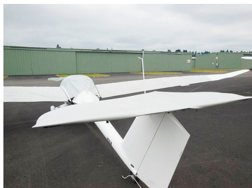
Lambada Canopy/Engine, Wing & Horiz. Stab. Covers