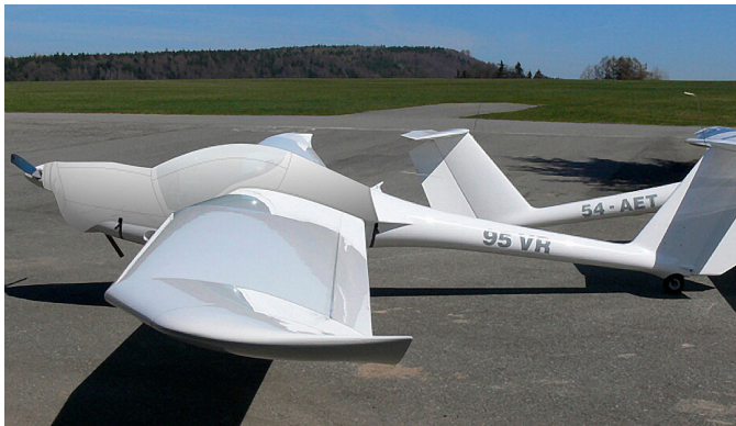
Lambda Canopy/Engine Cover (illustration)