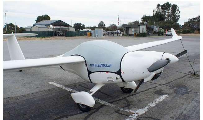
Lambda Travel Canopy Cover