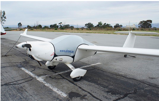
Lambda Canopy Cover