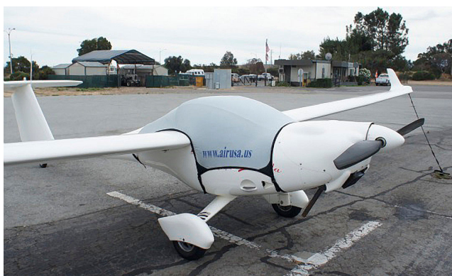
Lambda Travel Canopy Cover