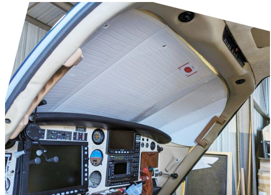
Velocity Windshield HeartShield