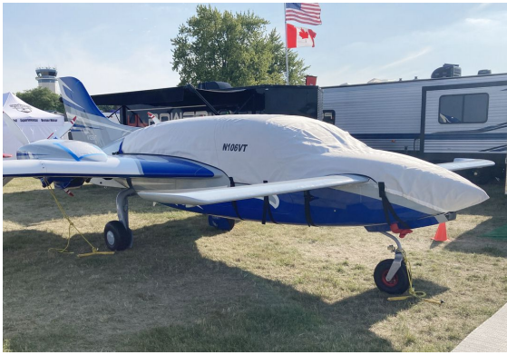
Twin Velocity Canopy/Nose Cover