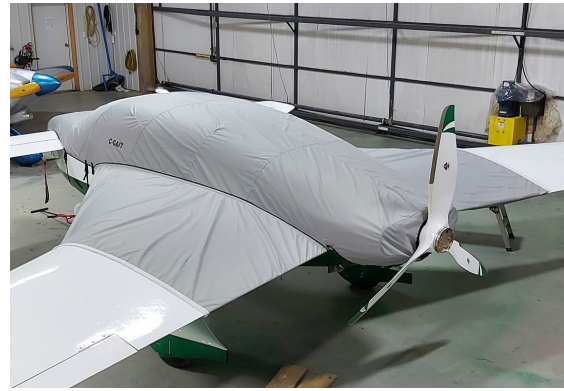
Velocity Canopy/Nose/Engine Cover, wing coverage varies