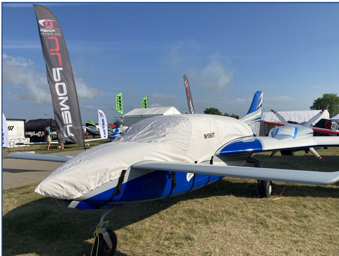
Twin Velocity Canopy/Nose Cover