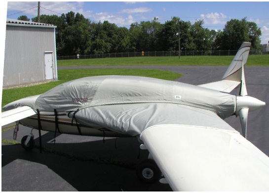
Velocity Canopy/Engine/Nose with Abbreviated Wing Covers