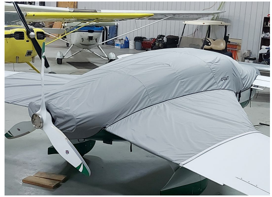
Velocity Canopy/Nose/Engine Cover, wing coverage varies