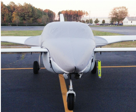
Velocity Travel Weight Canopy/Nose/Engine Cover, XI Model

Travel Covers are made with Silver Solution-Dyed Polyester fabric and only lined over the windshield to save weight. The material is lightweight and more compact for easy stowage in the aircraft. The polyester material is water resistant, but only intended for occasional use outside. We also have an ultra lightweight material available for fitted hangar dust covers. For daily outdoor use, the non-travel Sunbrella Cover is the best choice.