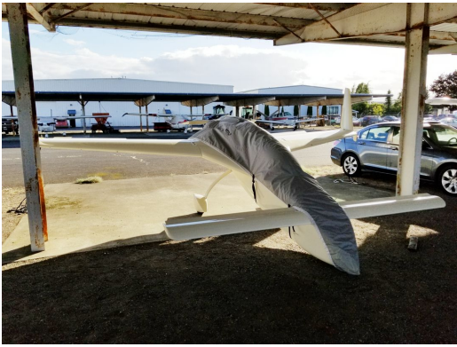
Rutan Vari EZ Travel Cover/Nose/Engine Cover