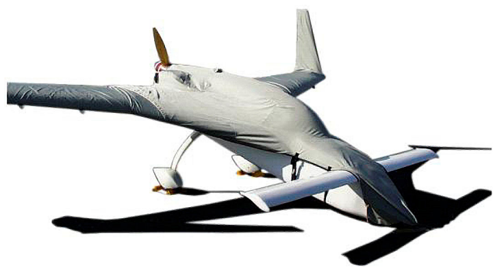
Long-EZ Canopy/Engine and Wing Covers