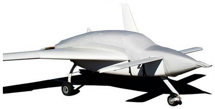
Velocity Canopy/Nose/Engine Cover