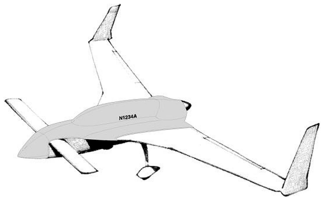
Rutan Long-EZ Canopy Cover