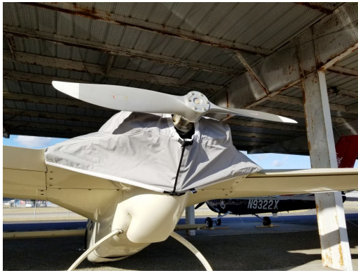
Rutan Vari EZ Travel Cover/Nose/Engine Cover