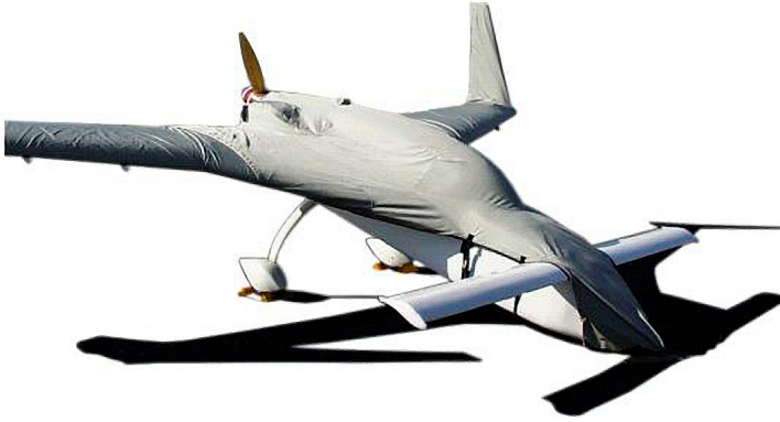
Long-EZ Canopy/Engine and Wing Covers