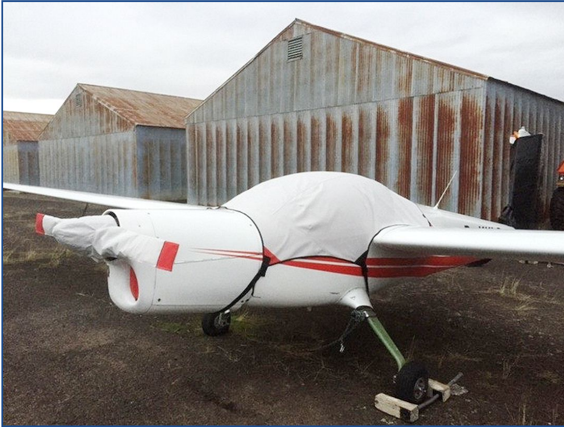
Vivat Canopy and Prop/Spinner Cover