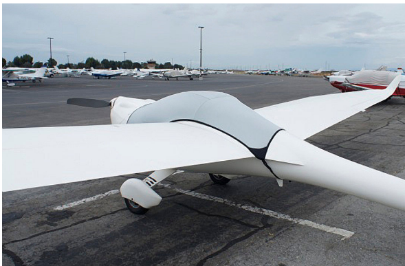
Lambada Canopy/Engine Cover and Wing Covers