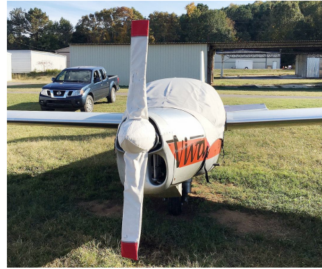
Aerotechnik L-13 Vivat Motorglider Prop/Spinner & Canopy Covers