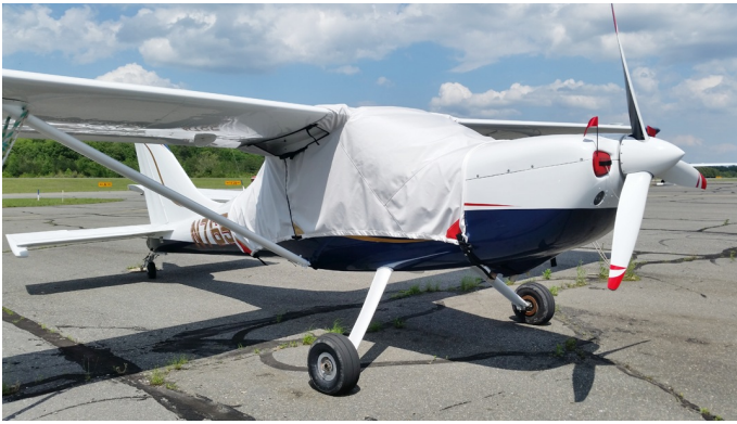
Glstar Over-Top Canopy Cover, Engine Plugs