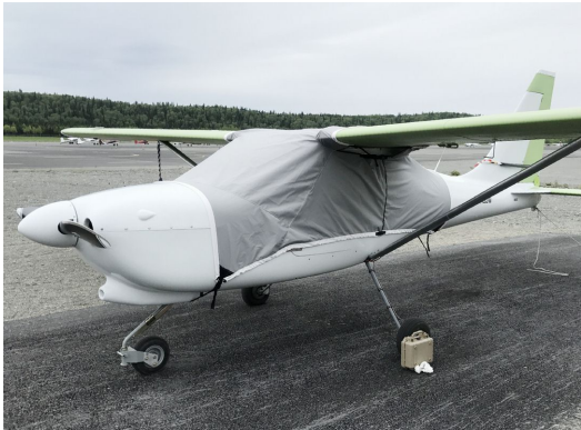
Glasair Aviation Glasair, Sportsman 2+2 Travel Cover, Light Weight Travel Canopy Cover