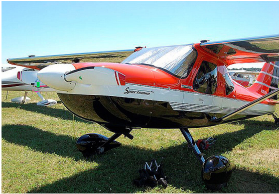
Glasair Sportsman Windshield HeatShield

window framing. It folds up flat and easily stores in the included storage sleeve. Some designs may require velcro and suction cups or split right and left sides. A Heatshield is an excellent short-term remedy for cockpit overheating. An external fabric cover is far more effective and practical for long-term protection.