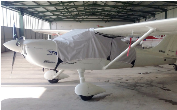
Vashon Ranger R7 Canopy Cover, Over-Top Type Glasair Aviation Glastar, Sportsman 2+2 Canopy Cover (Over-The-Top Style)