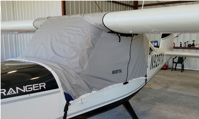
Vashon Ranger R7 Travel Weight Canopy Cover

Travel Covers are made with Silver Solution-Dyed Polyester fabric and only lined over the windshield to save weight. The material is lightweight and more compact for easy stowage in the aircraft. The polyester material is water resistant, but only intended for occasional use outside. We also have an ultra lightweight material available for fitted hangar dust covers. For daily outdoor use, the non-travel Sunbrella Cover is the best choice.