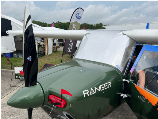
Vashon Ranger VR-7 Engine Plugs, Windshield HeatShield