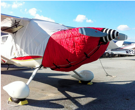
Glstar Insulated Engine Cover