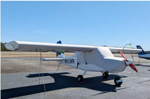
Vashon R7 Ranger Canopy/Engine, Wing & Horiz. Stab. Covers