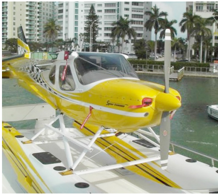
Glstar Engine Plugs