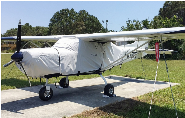
World Aircraft Extended Canopy Cover & Engine Cover

This cover type is made from Silver Acrylic Sunbrella canvas and is 100% lined with a soft and smooth microfiber. Bruce's Custom Covers developed this material combination especially for aircraft protection. The outer material is medium weight and treated for water resistance, UV resistance and anti-static buildup. The inner lining is a very soft and smooth microfiber to prevent scratching. The material is very reflective, and tests show that the cabin interior temperature can be reduced to near-ambient temperature on the hottest of days. It is water, ice and snow repellent, yet breathable to allow moisture to escape from between the cover and the aircraft surface.