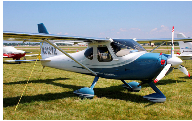
Glstar Sportsman Engine Inlet Plugs