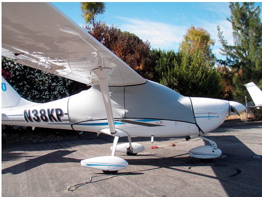
Glstar Spandex FlyAway Travel Canopy Cover

This cover type is made from Silver Acrylic Sunbrella canvas and is 100% lined with a soft and smooth microfiber. Bruce's Custom Covers developed this material combination especially for aircraft protection. The outer material is medium weight and treated for water resistance, UV resistance and anti-static buildup. The inner lining is a very soft and smooth microfiber to prevent scratching. The material is very reflective, and tests show that the cabin interior temperature can be reduced to near-ambient temperature on the hottest of days. It is water, ice and snow repellent, yet breathable to allow moisture to escape from between the cover and the aircraft surface.