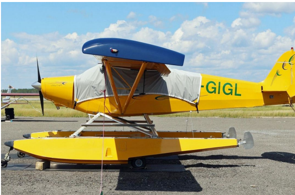
Wag Aero Sportsman 2+2 Canopy Cover