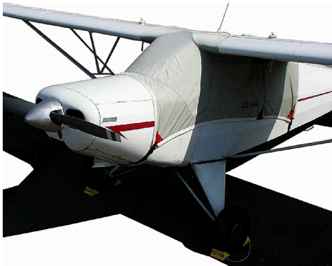
Piper PA-12 Super Cruiser Over-Top Canopy Cover

This cover type is made from Silver Acrylic Sunbrella canvas and is 100% lined with a soft and smooth microfiber. Bruce's Custom Covers developed this material combination especially for aircraft protection. The outer material is medium weight and treated for water resistance, UV resistance and anti-static buildup. The inner lining is a very soft and smooth microfiber to prevent scratching. The material is very reflective, and tests show that the cabin interior temperature can be reduced to near-ambient temperature on the hottest of days. It is water, ice and snow repellent, yet breathable to allow moisture to escape from between the cover and the aircraft surface.