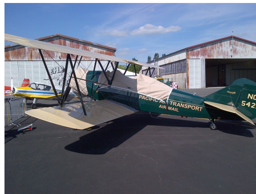
Travelair 4000 Canopy and Engine Cover