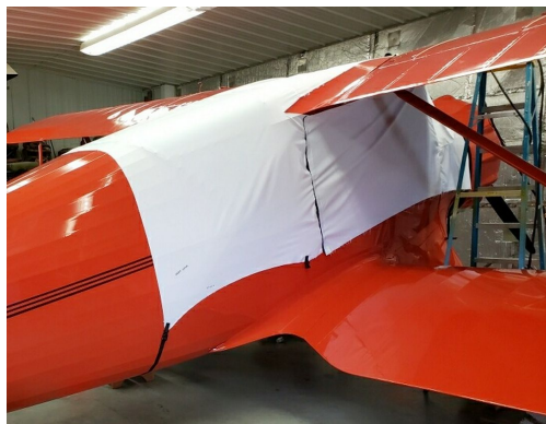
Waco YKC Canopy Cover, test fit cover