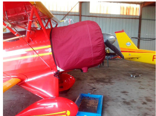
Waco Engine Cover