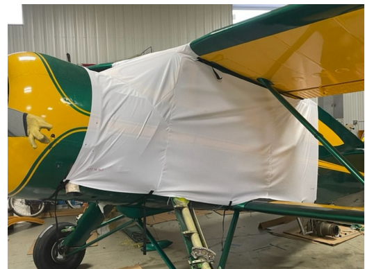
Waco ZGC-8 Canopy Cover, test fit cover