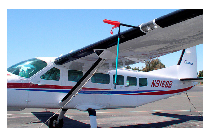
Cessna 208 Caravan Telescoping Pitot (for amphib. models)