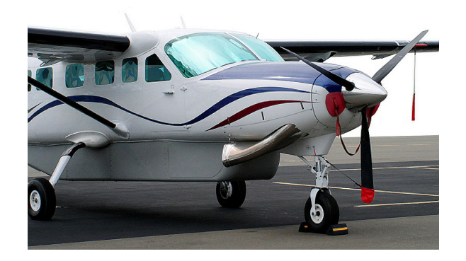
Cessna Caravan Windshield HeatShield, Plugs, Prop Ties & Pitot Cover

Waco YMF-5 Pitot Tube Covers, NOT HEAT RESISTANT TYPE, are made of Naugahyde vinyl, and are designed to cover the entire pitot assembly. Slipping over the tube, the cover tightens around the base with a Velcro strap detail. A "Remove Before Flight" streamer is attached to the cover. Heat Resistant Pitot Covers are an upgrade to this design, and help prevent the pitot cover from melting onto the tube if the pitot heat is accidentally turned on while installed. If you want the set tethered together, please let us know.