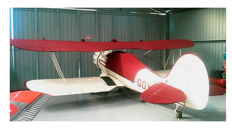
Waco YMF-5 Engine, Extended Canopy & Wing Covers Waco UPF-7 Upper Wing Cover, Horizontal Stabilizer Cover & Canopy Cover