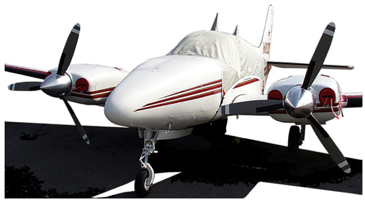
Baron 58 Standard Canopy Cover & Engine Plugs