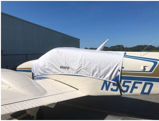
Beech Baron 95-B55 Canopy cover