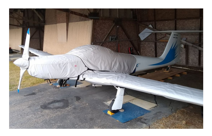
Aeromot Ximango Extended Canopy Cover, Engine, Prop & Wing Covers