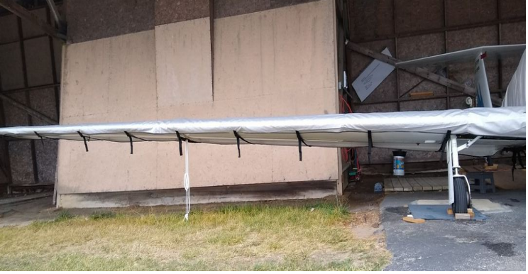
Aeromot Ximango Extended Canopy Cover, Engine, Prop & Wing Covers