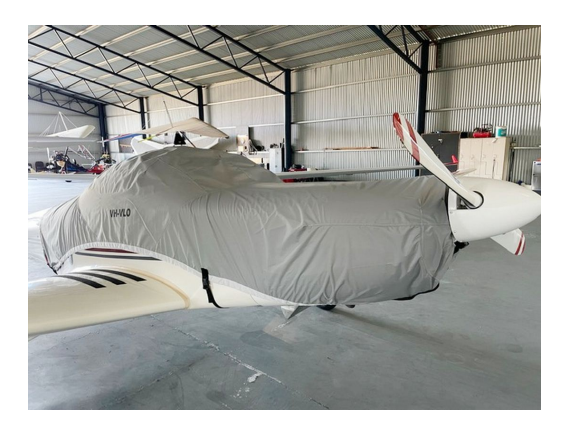
Ximango Travel Weight Canopy/Engine Cover