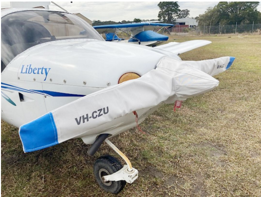
XL-2 PROPELLOR/SPINNER COVER