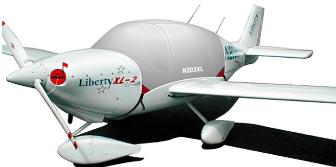
XL-2 Canopy Cover & Engine Plugs (Illustration)