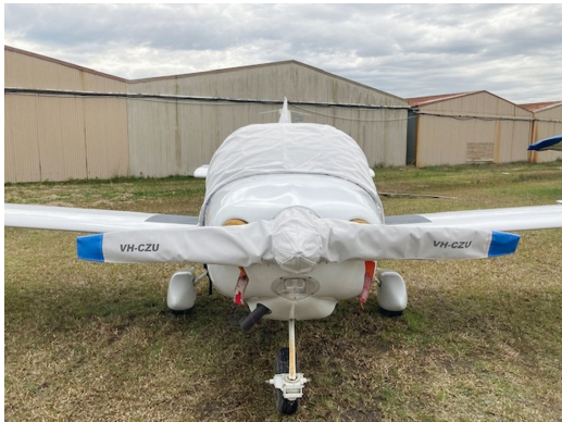
XL-2 PROPELLOR/SPINNER COVER

This cover type is made from Silver Acrylic Sunbrella canvas and is 100% lined with a soft and smooth microfiber. Bruce's Custom Covers developed this material combination especially for aircraft protection. The outer material is medium weight and treated for water resistance, UV resistance and anti-static buildup. The inner lining is a very soft and smooth microfiber to prevent scratching. The material is very reflective, and tests show that the cabin interior temperature can be reduced to near-ambient temperature on the hottest of days. It is water, ice and snow repellent, yet breathable to allow moisture to escape from between the cover and the aircraft surface.