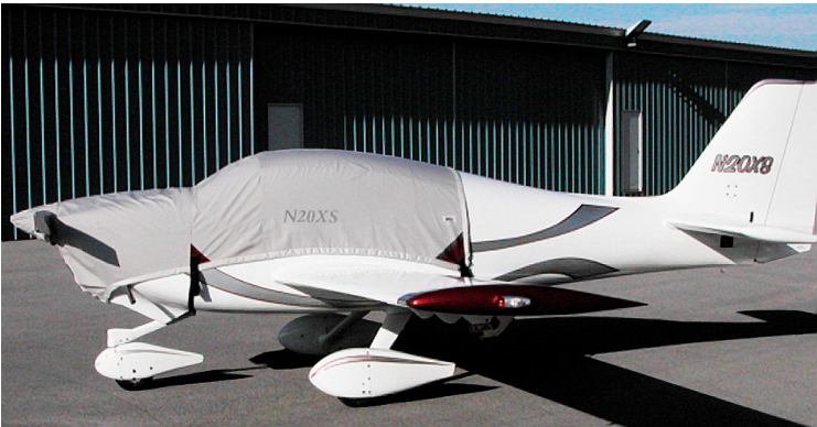
Canopy/Engine and Prop/Spinner Covers (tri-gear model)

Travel Covers are made with Silver Solution-Dyed Polyester fabric and only lined over the windshield to save weight. The material is lightweight and more compact for easy stowage in the aircraft. The polyester material is water resistant, but only intended for occasional use outside. We also have an ultra lightweight material available for fitted hangar dust covers. For daily outdoor use, the non-travel Sunbrella Cover is the best choice.