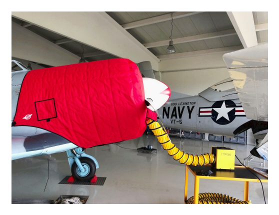
Yak 11 Insulated Engine Cover

Engine Inlet Plugs are custom fit for your Yakovlev Yak 11 intakes, made with heavy-duty vinyl material, and stuffed with a single block of sculpted urethane foam. Each plug has a zipper that allows the foam to be removed and dried if necessary. Engine plugs have warning flags that are visible from the cockpit or 'remove before flight' streamers sewn onto the face of the plugs. Most plugs are imprinted with the aircraft registration number in black for an extra charge. Storage bag NOT included. Engine plugs may be inserted after flight when the engine is still warm. Engine Inlet Plugs are commonly referred to as Cowl Plugs, Intake Plugs, Cowl Blocks, Engine Blocks, and Engine Bungs.