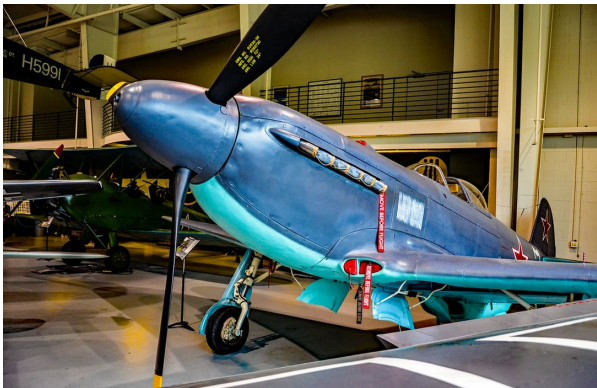
Yakovlev Yak 3 Oil Cooler Inlet Plugs

Engine Inlet Plugs are custom fit for your Yakovlev Yak 3 intakes, made with heavy-duty vinyl material, and stuffed with a single block of sculpted urethane foam. Each plug has a zipper that allows the foam to be removed and dried if necessary. Engine plugs have warning flags that are visible from the cockpit or 'remove before flight' streamers sewn onto the face of the plugs. Most plugs are imprinted with the aircraft registration number in black for an extra charge. Storage bag NOT included. Engine plugs may be inserted after flight when the engine is still warm. Engine Inlet Plugs are commonly referred to as Cowl Plugs, Intake Plugs, Cowl Blocks, Engine Blocks, and Engine Bungs.