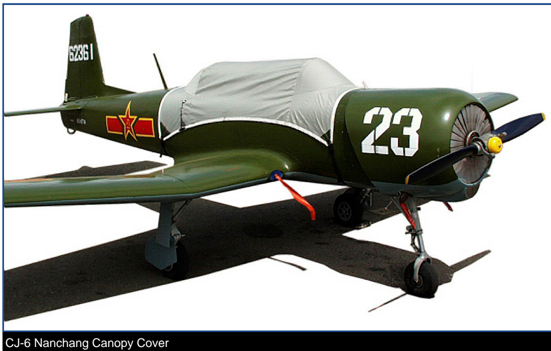
CJ-6 Nanchang Canopy Cover