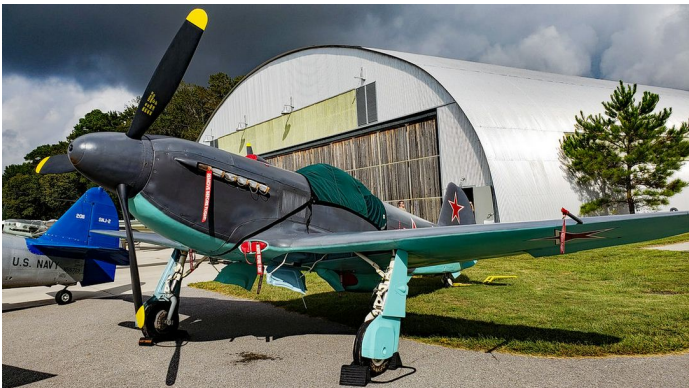
Yakovlev Yak 3 Oil Cooler Inlet Plugs (In Wing Root)