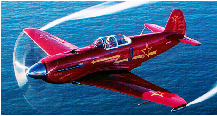
Canopy Cover for the Yak 3