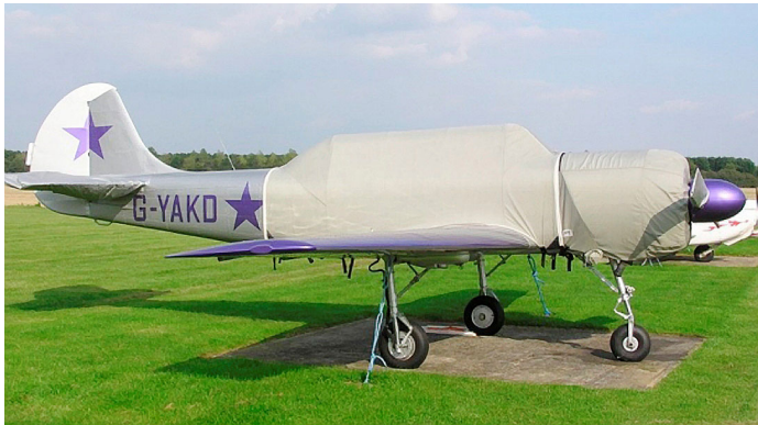
Yak 52 Extended Canopy, Engine & Horiz. Stab. Covers

This cover type is made from Silver Acrylic Sunbrella canvas and is 100% lined with a soft and smooth microfiber. Bruce's Custom Covers developed this material combination especially for aircraft protection. The outer material is medium weight and treated for water resistance, UV resistance and anti-static buildup. The inner lining is a very soft and smooth microfiber to prevent scratching. The material is very reflective, and tests show that the cabin interior temperature can be reduced to near-ambient temperature on the hottest of days. It is water, ice and snow repellent, yet breathable to allow moisture to escape from between the cover and the aircraft surface.