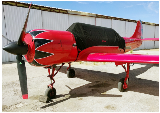
Yakovlev Yak 52 Travel Cover