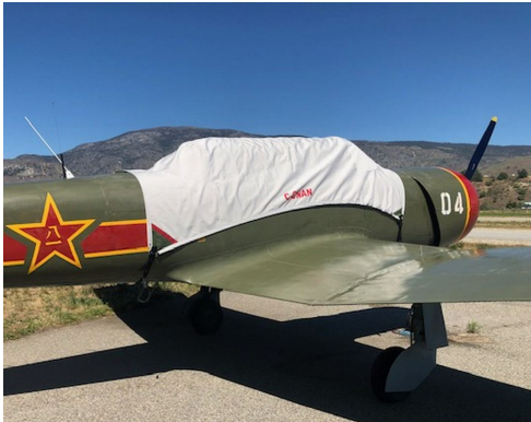
Yak 52 Canopy Cover

This cover type is made from Silver Acrylic Sunbrella canvas and is 100% lined with a soft and smooth microfiber. Bruce's Custom Covers developed this material combination especially for aircraft protection. The outer material is medium weight and treated for water resistance, UV resistance and anti-static buildup. The inner lining is a very soft and smooth microfiber to prevent scratching. The material is very reflective, and tests show that the cabin interior temperature can be reduced to near-ambient temperature on the hottest of days. It is water, ice and snow repellent, yet breathable to allow moisture to escape from between the cover and the aircraft surface.