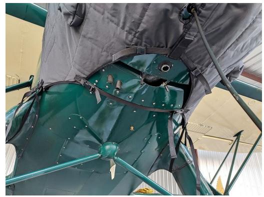
Travel Air 4000 Canopy and Engine Covers, light weight travel type