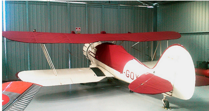
Waco UPF-7 Upper Wing Cover, Horizontal Stabilizer Cover & Canopy Cover

WINTER USE MATERIAL - Made with Solution-Dyed Polyester fabric, this option is intended for seasonal use to aid in deicing, rain mitigation, or for occasional travel. The material is lighter and more compact, but more susceptible to UV damage and may have a shorter useful life if used continuously outside than the all-year use material.