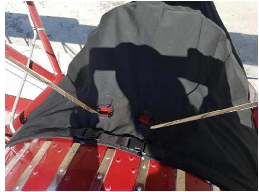
Waco UPF-7 Canopy Cover