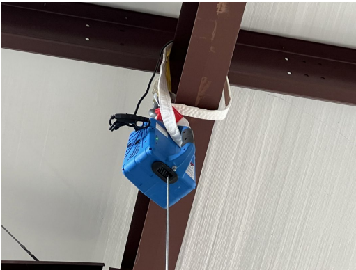
Stearman PT-13 Full Body Dust Cover, Remote Control Winch

Some high value aircraft end up logging lots of hangar time, and become dust magnets in the process. A high quality, well fitting dust cover provides easy assurance that the aircraft's surfaces remain clean and free of grit and grime. Available in a large variety of colors, each dust cover is custom made according to aircraft details and customer preferences. Fire retardant fabrics are also available.