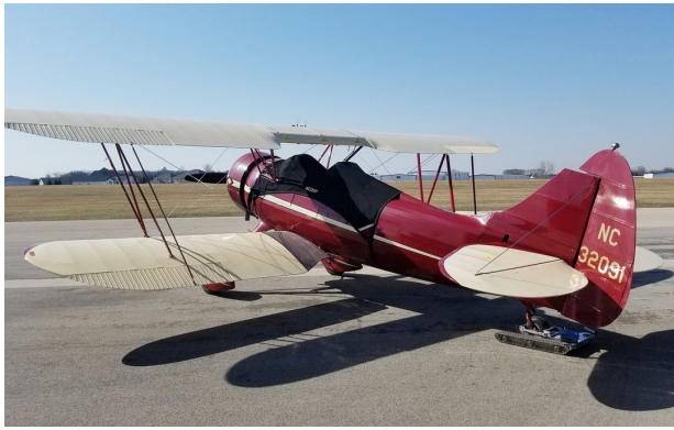
Waco UPF-7 Canopy Cover