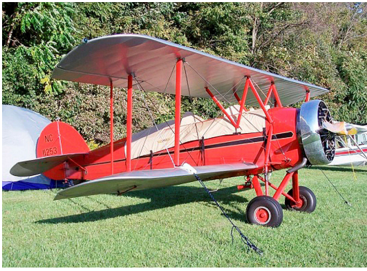
Waco ASO Canopy Cover