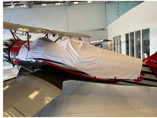
Waco YMF-5 Canopy with Turtledeck Extension, test fit cover