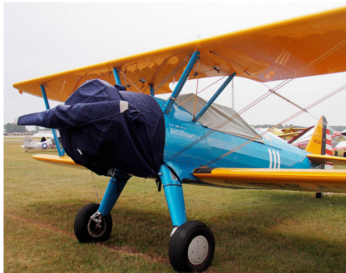
Stearman Canopy, Engine & Prop Covers

This cover type is made from Silver Acrylic Sunbrella canvas and is 100% lined with a soft and smooth microfiber. Bruce's Custom Covers developed this material combination especially for aircraft protection. The outer material is medium weight and treated for water resistance, UV resistance and anti-static buildup. The inner lining is a very soft and smooth microfiber to prevent scratching. The material is very reflective, and tests show that the cabin interior temperature can be reduced to near-ambient temperature on the hottest of days. It is water, ice and snow repellent, yet breathable to allow moisture to escape from between the cover and the aircraft surface.