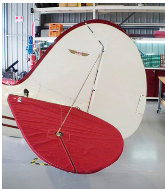
Waco UPF-7 Horizontal Stab. Cover

WINTER USE MATERIAL - Made with Solution-Dyed Polyester fabric, this option is intended for seasonal use to aid in deicing, rain mitigation, or for occasional travel. The material is lighter and more compact, but more susceptible to UV damage and may have a shorter useful life if used continuously outside than the all-year use material.