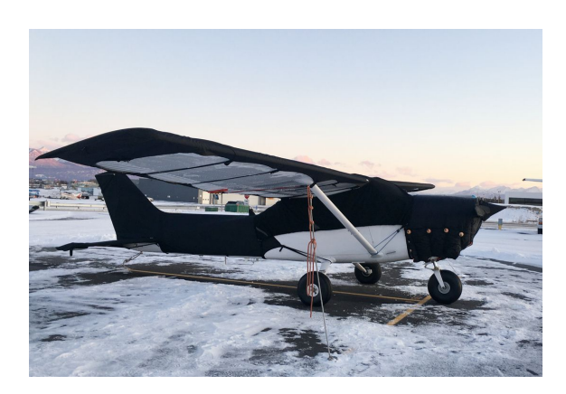
Cessna 172M Canopy, Wings, Horiz. Stab., Insulated Engine & Prop Covers