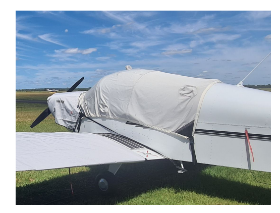
Zenith CH-2000 Canopy & Engine Covers

This cover type is made from Silver Acrylic Sunbrella canvas and is 100% lined with a soft and smooth microfiber. Bruce's Custom Covers developed this material combination especially for aircraft protection. The outer material is medium weight and treated for water resistance, UV resistance and anti-static buildup. The inner lining is a very soft and smooth microfiber to prevent scratching. The material is very reflective, and tests show that the cabin interior temperature can be reduced to near-ambient temperature on the hottest of days. It is water, ice and snow repellent, yet breathable to allow moisture to escape from between the cover and the aircraft surface.