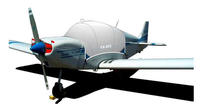
AMD Alarus CH2000 Std Canopy Cover & Engine Plugs (Illustration)