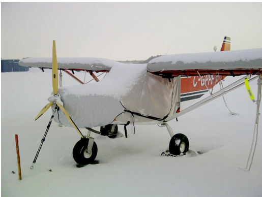
Zenith 701 Canopy, Wing, Tail & Insulated Engine Covers