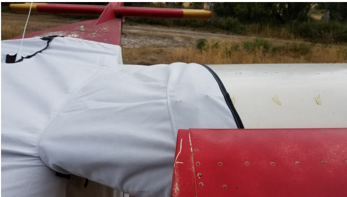
Zenair 801 Extended Canopy Cover (Over-the-Top Style)

This cover type is made from Silver Acrylic Sunbrella canvas and is 100% lined with a soft and smooth microfiber. Bruce's Custom Covers developed this material combination especially for aircraft protection. The outer material is medium weight and treated for water resistance, UV resistance and anti-static buildup. The inner lining is a very soft and smooth microfiber to prevent scratching. The material is very reflective, and tests show that the cabin interior temperature can be reduced to near-ambient temperature on the hottest of days. It is water, ice and snow repellent, yet breathable to allow moisture to escape from between the cover and the aircraft surface.