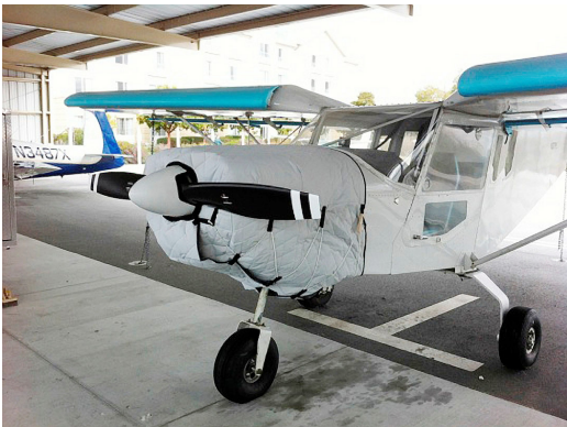
Zenith 801 Insulated Engine Cover

This cover type is made from Silver Acrylic Sunbrella canvas and is 100% lined with a soft and smooth microfiber. Bruce's Custom Covers developed this material combination especially for aircraft protection. The outer material is medium weight and treated for water resistance, UV resistance and anti-static buildup. The inner lining is a very soft and smooth microfiber to prevent scratching. The material is very reflective, and tests show that the cabin interior temperature can be reduced to near-ambient temperature on the hottest of days. It is water, ice and snow repellent, yet breathable to allow moisture to escape from between the cover and the aircraft surface.