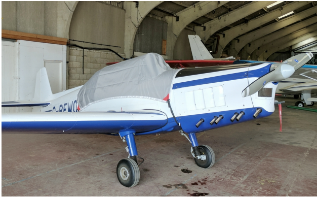
Zlin 326 Travel Cover

the hottest of days. It is water, ice and snow repellent, yet breathable to allow moisture to escape from between the cover and the aircraft surface.