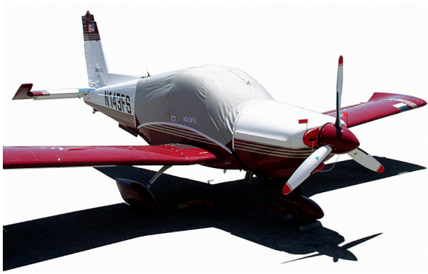
Zlin 143 Canopy Cover and Engine Plugs