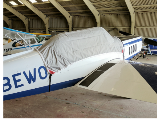
Zlin 326 Travel Cover